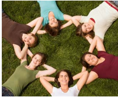
Our Student Council helps all of us connect to school, friends and fun!!!!